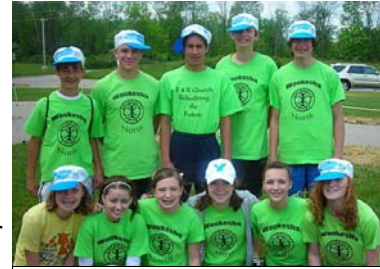
Spikes is primarily about youth. Here is the team of the Waukesha North HS Interact Club.