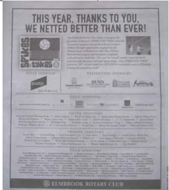
Spikes donors were thanked in a full-page ad in the Brookfield-EG NOW section of the Journal Sentinel.

[Editor's note: Preliminary net profit is approximately $37,000. PLUS, the Silent Auction proceeds exceeded $3600. !!] ERN