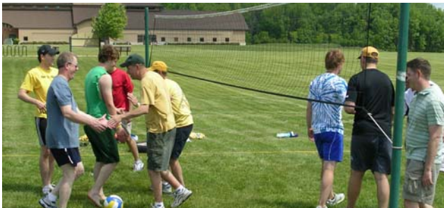
ERC vs WMRC: "Good game. Good game".